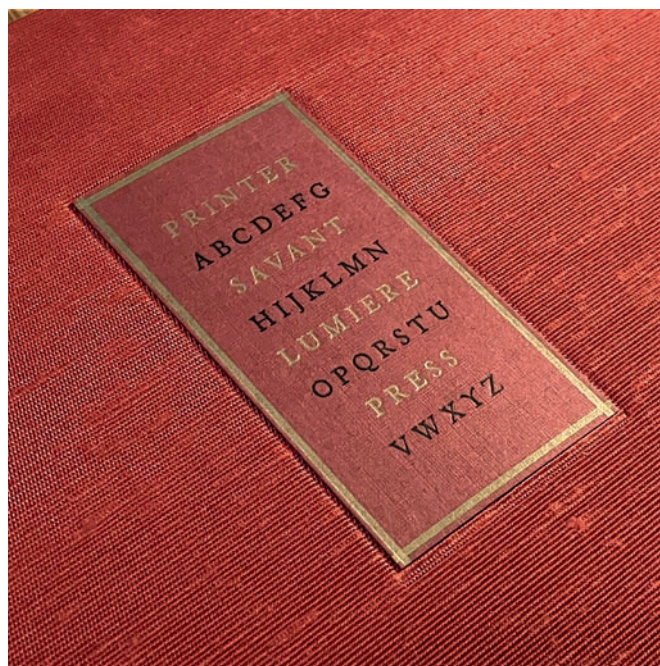
Detail of cover, Lumiere Press: Printer Savant and Other Stories.